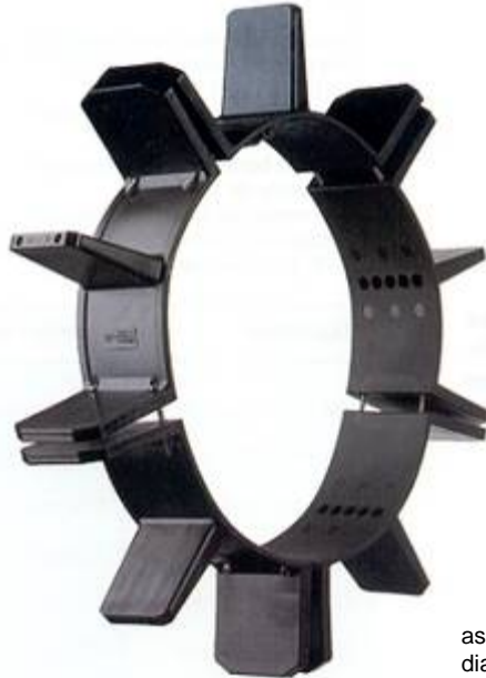
assembled insulator ring using 5 GK 3 segments (for pipe diameters between 415-445 mm).

Segment sizes GK 1, GK 2 and GK 3 can be combined with each other at will.